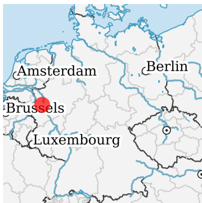
Location in germany