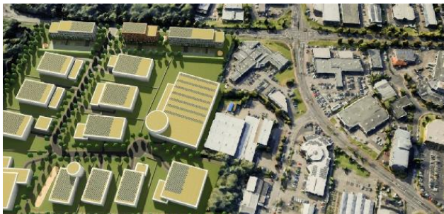
Gewerbequartier an der A 57 - Alte Heerstraße Dormagen