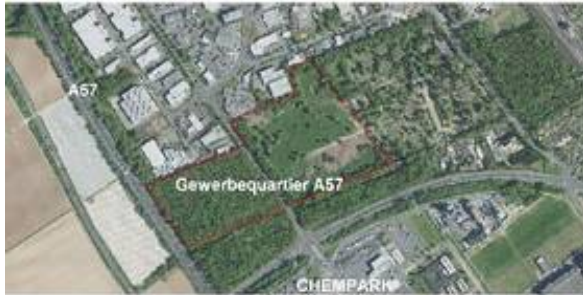
Büro- und Gewerbequartier A57.jpg