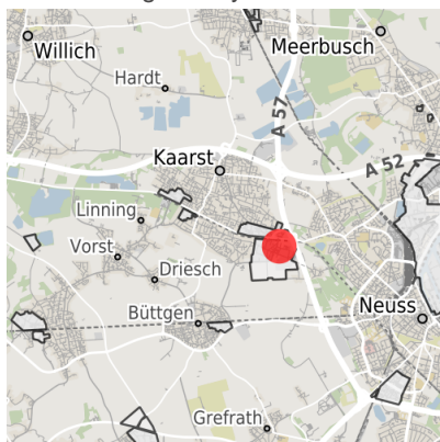
Location in municipality