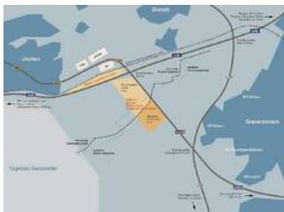
Interkommunales Gewerbegebiet Juechen-Grevenbroich