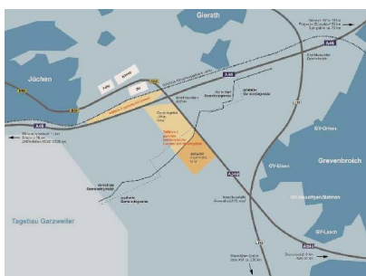
Interkommunales Gewerbegebiet Juechen-Grevenbroich