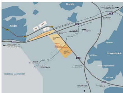
Interkommunales Gewerbegebiet Juechen-Grevenbroich