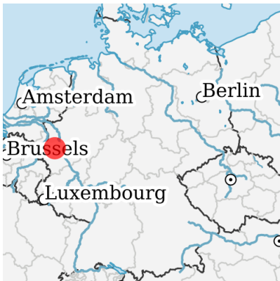
Location in germany