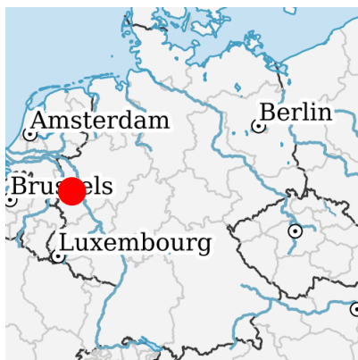
Location in germany